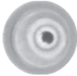
Well with disk