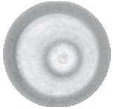
Well without disk